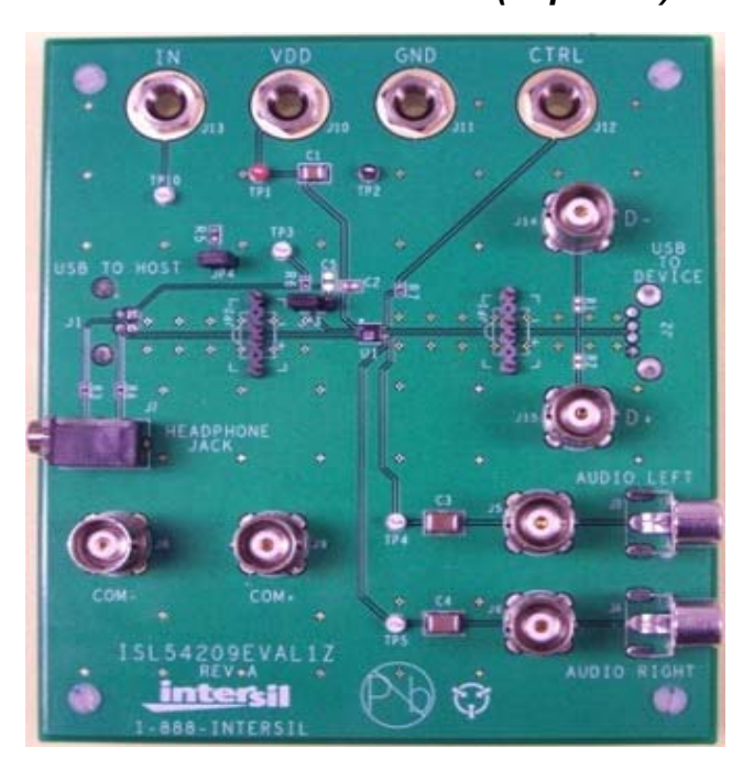
FIGURE 1. ISL54209EVAL1Z EVALUATION BOARD